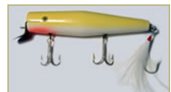
Lil Momma Surface ( enlarge )