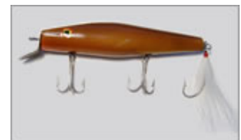
Lil Momma Diver ( enlarge )